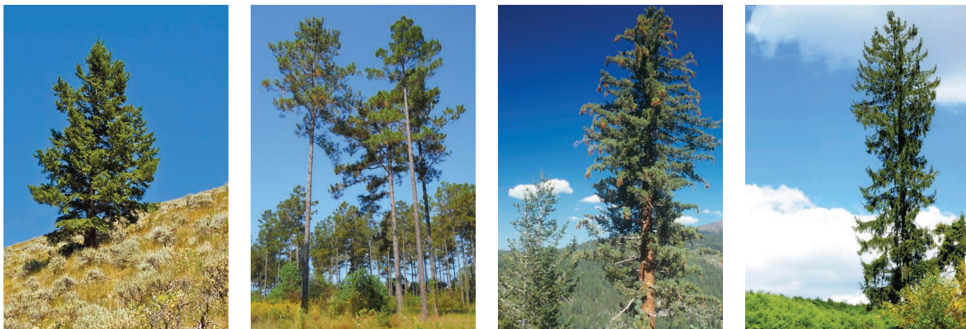
Filling out the tree. Now the gymnosperms (left to right) Douglas fir, loblolly pine, sugar pine, and Norway spruce are being sequenced.

with just two copies of each chromosome, whereas maize seemed to come from a polyploid; its extra chromosomes might have made piecing together sequenced DNA an even more daunting task.